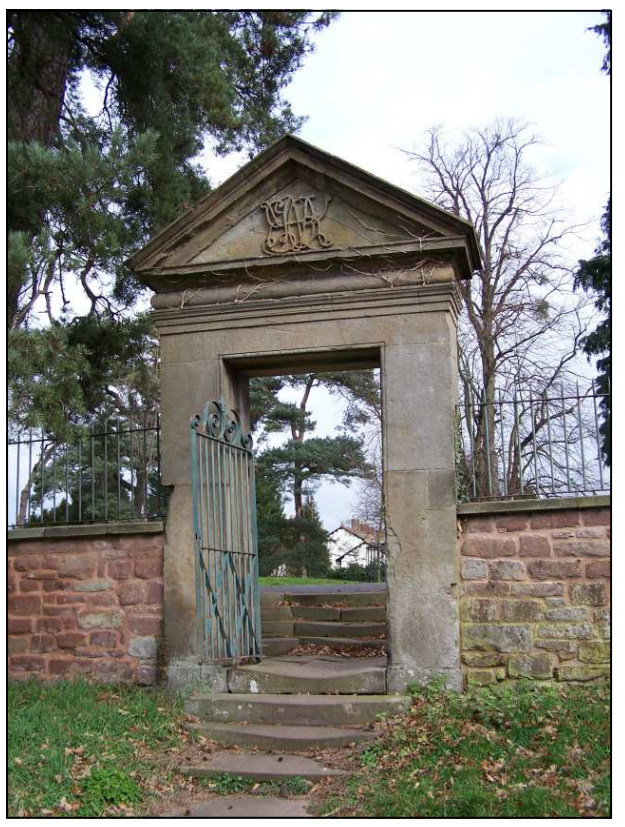
John Kyrle's gate dated 1700

The Society's role is to promote knowledge of the historical context of Ross and the surrounding parishes and villages, whilst recognising that change and progress is essential for the growth of a vibrant community. The Society fulfils this role by holding regular meetings, producing publications, examining planning applications and monitoring footpaths and byways.