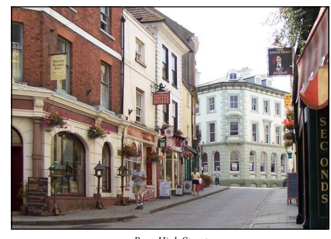
Ross High Street

The major portion of the town has been designated a Conservation Area and it contains many listed buildings of historical importance. Public gardens and walks offer magnificent views of the River Wye and the surrounding countryside.