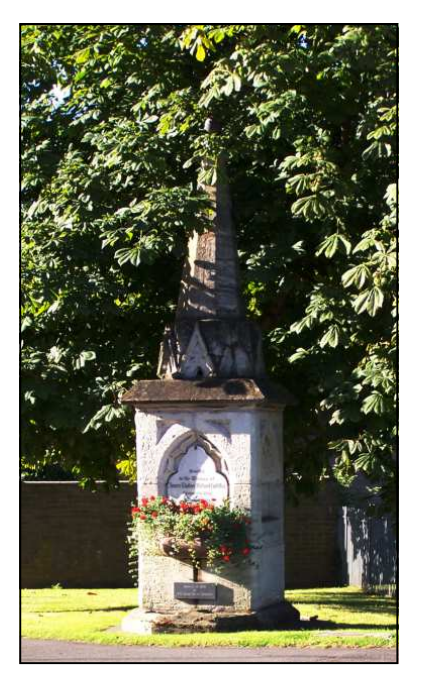
Wallace Hall monument