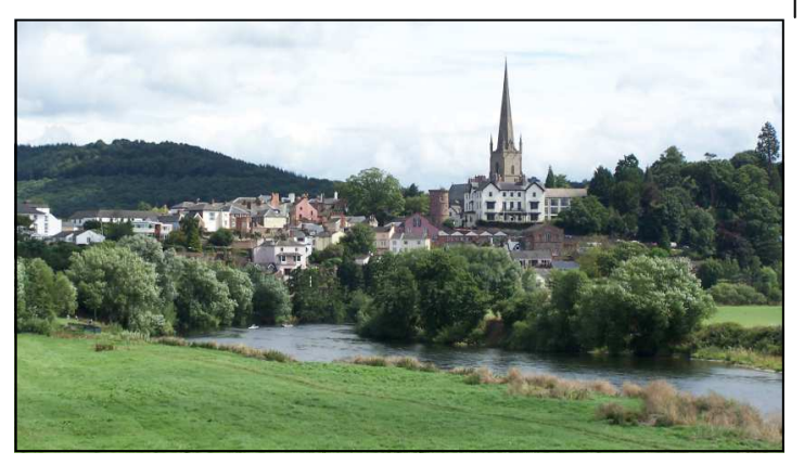
Ross overlooking the River Wye